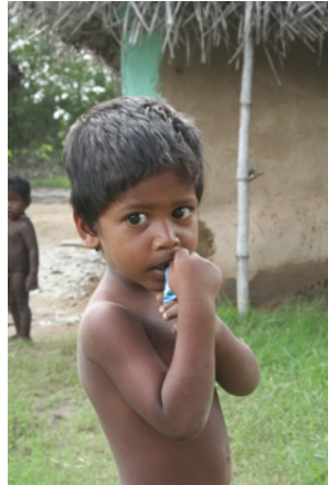
A little Dalit boy in Tamil Nadu stares at the camera, completely ignorant of proper hygiene and prone to dangerous water borne diseases

The Boond movement believes that through awareness campaigns and by utilization of simple low cost water filters, this crisis can be easily prevented.